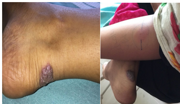
Figure 1: Well-defined hyper-pigmented indurated verrucous plaque over the posterior aspect of the right ankle.

Based on the history, clinical picture and clinic-pathology reports, diagnosis of tuberculosis verrucosa cutis were made.